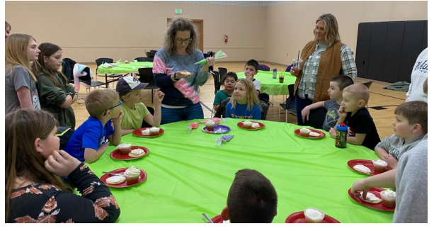
Cake and cookie decorating was the monthly activity for Somethin' Special 4-H Club.