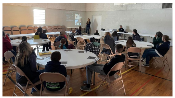
Circle B 4-H Club had a representative from MAC attend their February meeting to talk about animal nutrition.